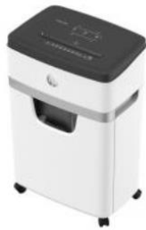
HP Shredder OneShred P4 18CC 18sh